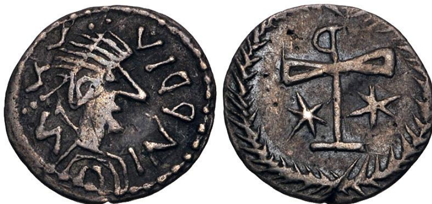
Silver half or third ‘siliqua’, Lombard Italy c. 568–690 (CNG).