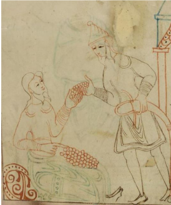
From London, British Library, Cotton Claudius B.IV, f. 22r.

To be held in GR06/7, Faculty of English, 8–9 January 2022