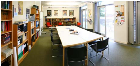
The ASNC Common room