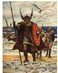
Image accompanying an article in The Week , 18 April 2009, with caption 'Vikings: became part of mainstream society.'