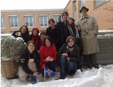
ASNCs celebrating the year's heaviest snowfall in style, with a snow long-ship on the ASNC terrace.

brief personal profiles of two ASNCs from the era before the two-part Tripos, in which they reflect on their careers since leaving Cambridge and the extent to which having been an ASNC made a difference.