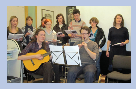
Members of the Modern Irish classes